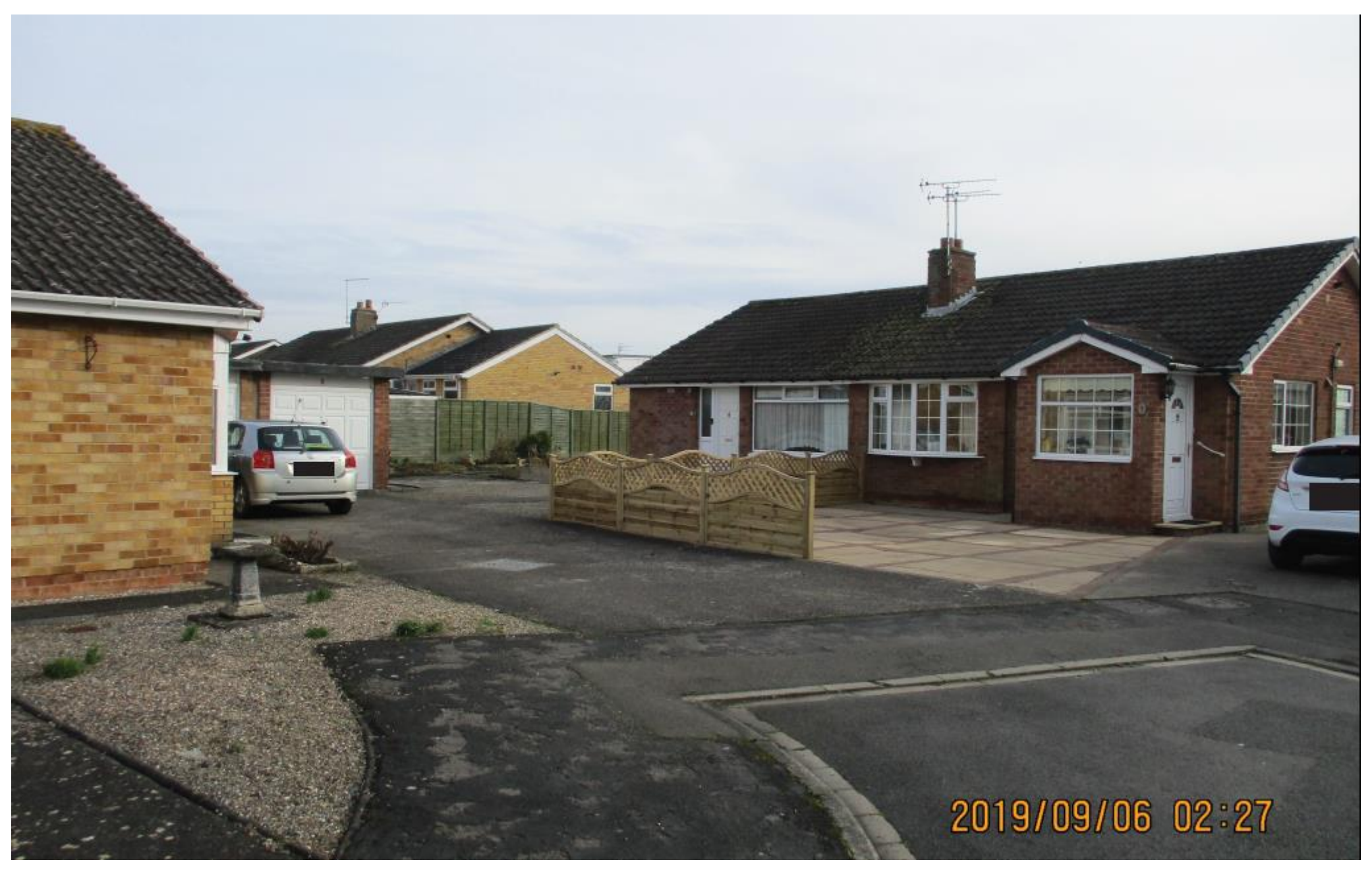
Area Planning Sub Committee Meeting - 5 August 2020